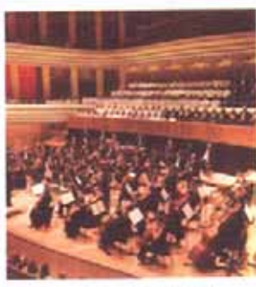
7 concert hall