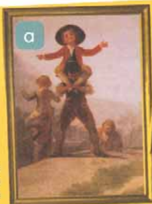
The Little Giants by Francisco de Goya

CONTENT WORDS artist colorful happy impressionist painter sad strange