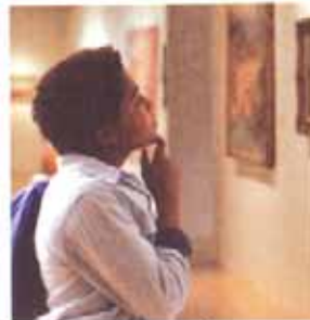
3 art gallery