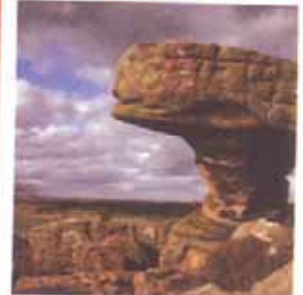
4 national park