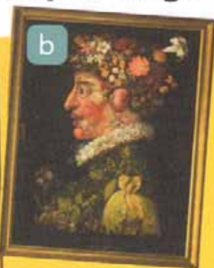
Spring 1573 by Giuseppe Arcimboldo