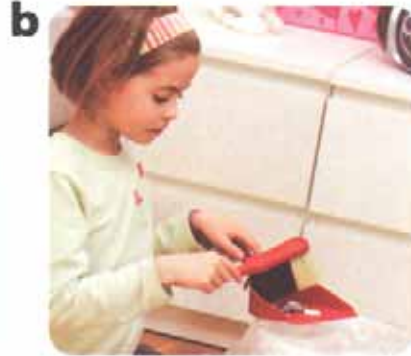
I clean my room after school.