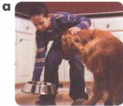
I feed the dog before school.