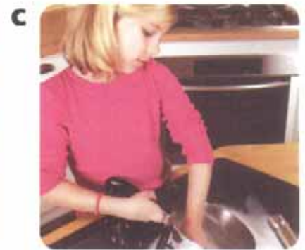
I wash the dishes after dinner.